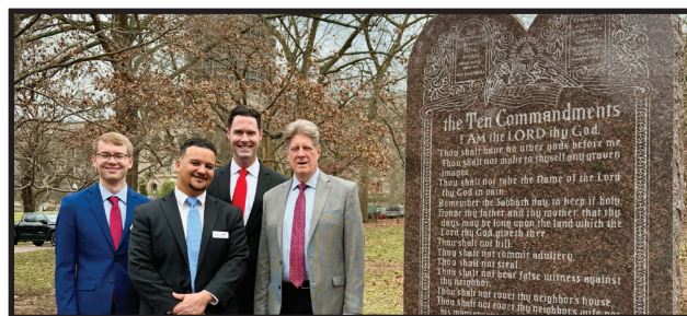
The historic Ten Commandments monument was restored to the Kentucky Capitol grounds on December 15, 2025.