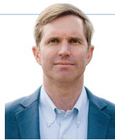
D ANDY BESHEAR