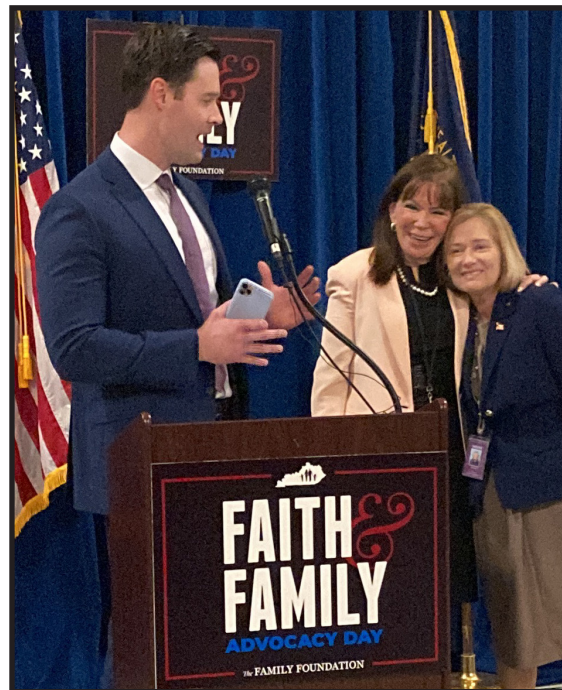
Pro-life leaders react to news of pro-life victory at the Kentucky Supreme Court during The Family Foundation's Faith & Family Advocacy Day on the morning of February 16, 2023.

Despite a legal challenge and Gov. Beshear attacking the pro-life law as "extremist," the Human Life Protection Act has now been in effect for over a year and preborn children remain protected throughout the Commonwealth.