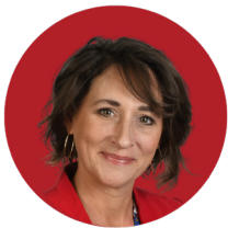
Lindsey Tichenor KY State Sen.