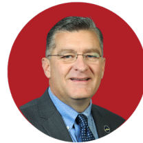
Robby Mills KY State Sen.