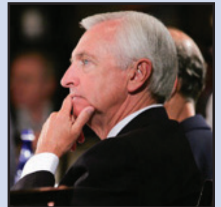
Gov. Beshear: A sad legacy

In recent weeks it was learned that during his last month in office he okayed Planned Parenthood's January opening of another abortion clinic in Louisville without proper licensing. And just last week it was revealed that his Administration had not been properly inspecting Kentucky's abortion clinics during his tenure.